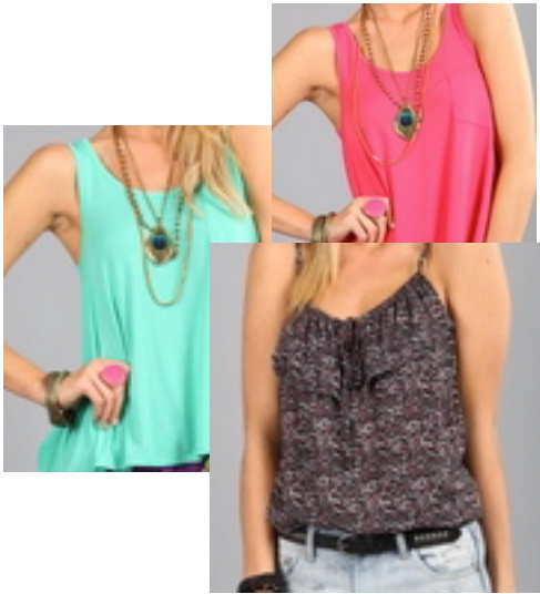
Singlets - $10 each