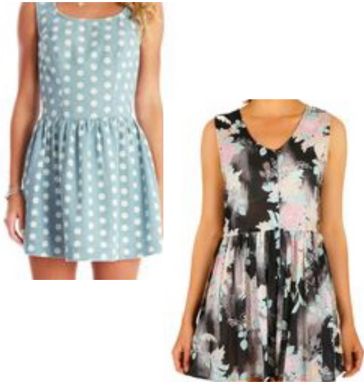
Surf brand dresses - $50 each