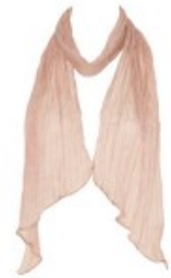
Scarf - $15