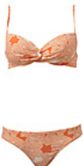
Bikini - $55