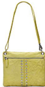
Bag - $70