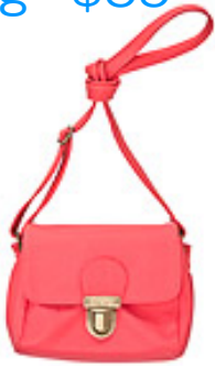
Bag - $35