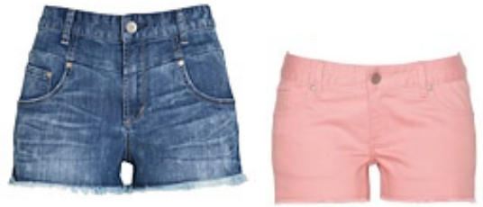
Shorts - $25 each